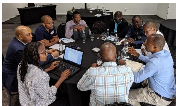
Group Discussions 28 November 2019