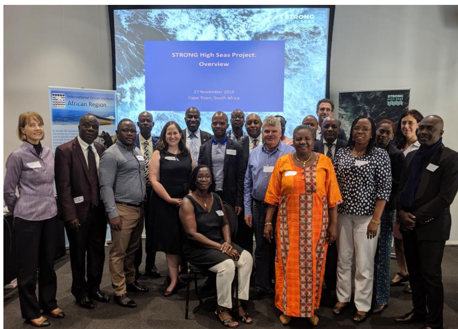
Participants at the STRONG High Seas Capacity Development Workshop, Cape Town, South Africa 27 November 2019