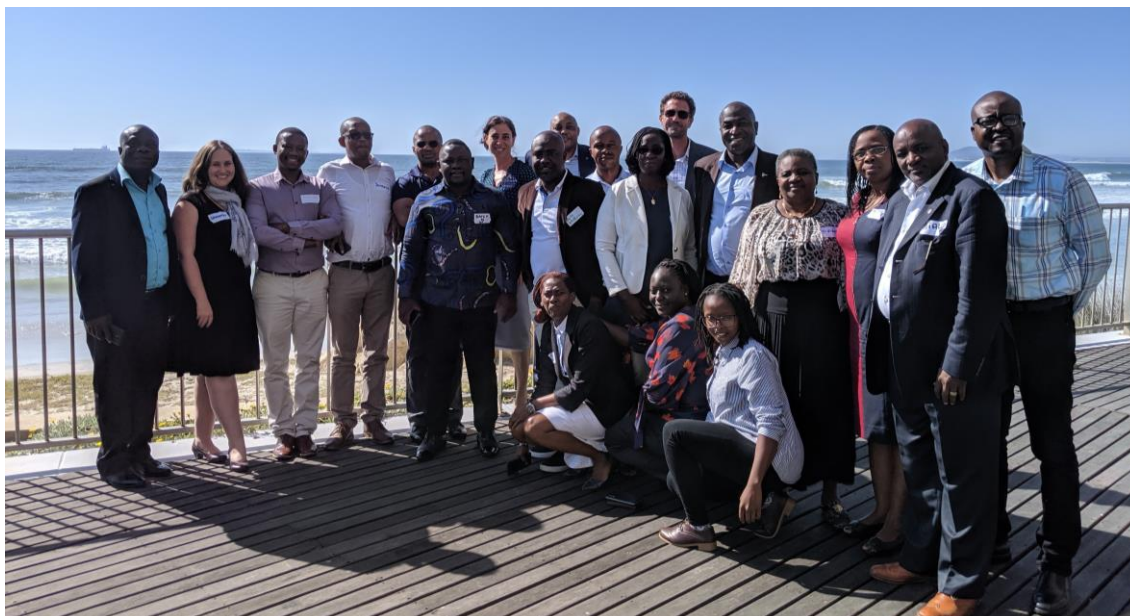
Participants at the STRONG High Seas Capacity Development Workshop, Cape Town, South Africa 28 November 2019

There is hope that the negotiated instrument will include formal requirements for capacity building to be supported and a fund to be developed that will ensure that this occurs. The participants hoped that African representatives will have support for active participation in defining the type of capacity building initiatives that will take place. They highlight the need for a regional mechanism on ocean governance to promote the role of science in decision making processes. It is hoped, by the participants in the workshop, that the mandate of the Abidjan Convention will be extended to include ABNJ and that an effective scientific committee is established within the Abidjan Convention to work on BBNJ issues so that they are able to provide meaningful advice to delegates and decision makers.